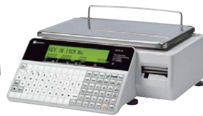
UNI-3 L1 Bench with LCD Display