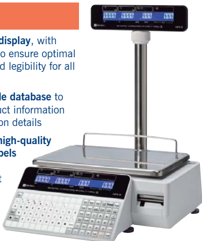
UNI-3 L1 Pole with Backlit Display