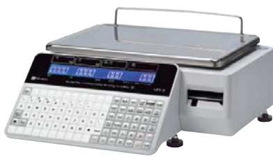
UNI-3 L1 Bench with Backlit Display