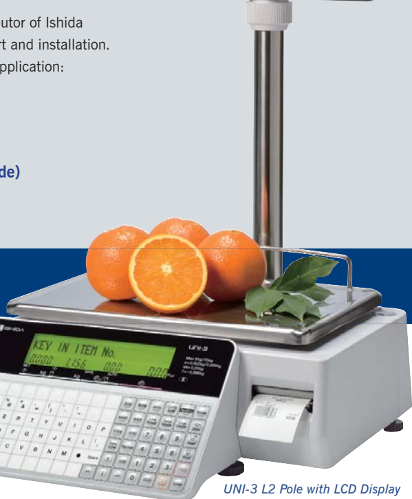
UNI-3 L2 Pole with LCD Display